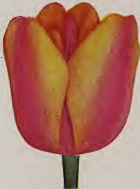
DARWIN TULIP AFTERGLOW